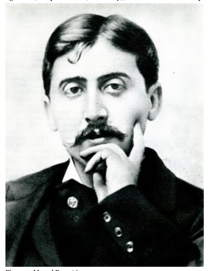
Figure 2: Marcel Proust in 1900.

bare plastic skin away, black patent-shiny hair, hornrim glasses..." ( GR , 675) Except for the glasses (and plastic skin, obviously), much of that matches photographs of Proust: